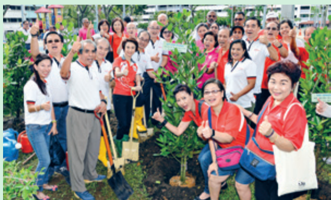
BUKIT GOMBAK TREE PLANTING DAY 4 NOVEMBER 2018

Let's look back at some beautiful memories forged with our family, friends and neighbours at various community events.