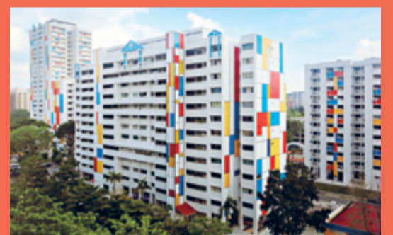
Completed R&R at Blocks 1 to 7 Teck Whye Crescent, Chua Chu Kang Division - Chua Chu Kang GRC

491 blocks have undergone Repair & Redecoration (R&R)