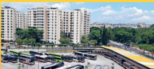
Completed Choa Chu Kang Bus Interchange

4 parks, 44 playgrounds and 48 fitness corners