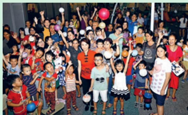
MID-AUTUMN FESTIVAL CELEBRATION 23 SEPTEMBER 2018