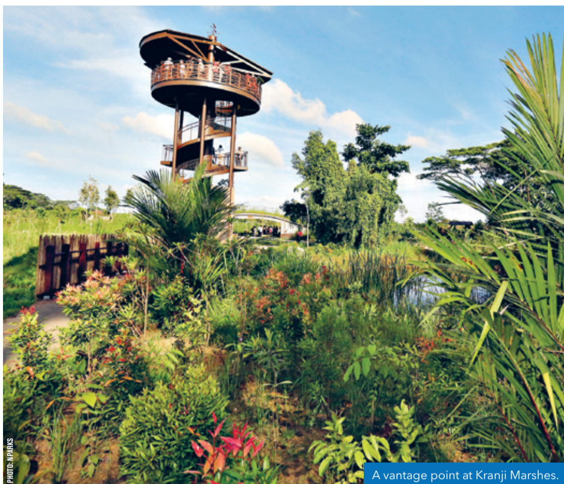
A vantage point at Kranji Marshes.

What we like: From 10.5m-high Raptor Tower, try spotting some of the rarer birds that call the marshes home. Among them are the Changeable Hawk and White-bellied Sea Eagle. Be sure to bring a pair of binoculars and your camera too!