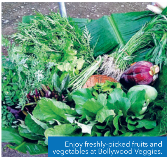
Enjoy freshly-picked fruits and vegetables at Bollywood Veggies.