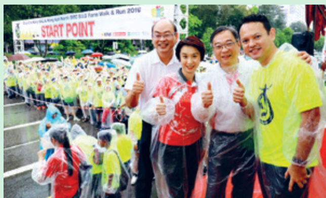
B.I.G FARM WALK & RUN 2018 14 OCTOBER 2018