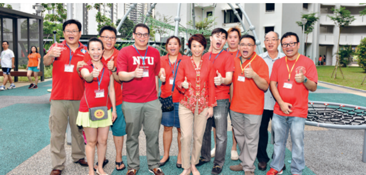
KEAT HONG AXIS AND KEAT HONG COLOURS ARE TWO BUILT-TO-ORDER (BTO) PROJECTS THAT WERE COMPLETED IN 2016. BLOCK PARTIES WERE HELD TO WELCOME NEW RESIDENTS TO THE ESTATE.