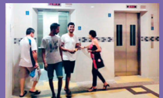
Completed Lift Replacement Programme at Block 434 Choa Chu Kang Ave 4, Keat Hong Division - Chua Chu Kang GRC