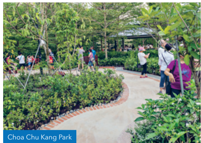
Choa Chu Kang Park