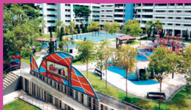
Completed Family Hub at Bukit Batok Street 32, Hong Kah North SMC

4 parks, 44 playgrounds and 48 fitness corners