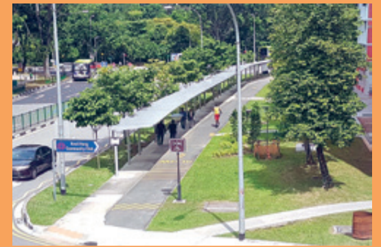
Walk2Ride Path Along Choa Chu Kang Ave 4

8,324 metres of Walk2Ride linkways and widened footpaths / cycling paths