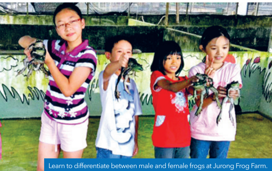
Learn to differentiate between male and female frogs at Jurong Frog Farm.