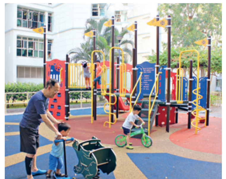
COMPLETED PLAYGROUND AT GOODVIEW