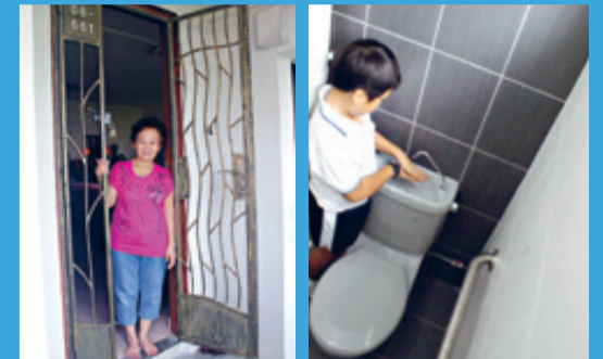
A completed HIP at Block 536 Bukit Batok St 52, Bukit Gombak Division - Chua Chu Kang GRC

5,602 units in total will benefit from the Home Improvement Programme (HIP)