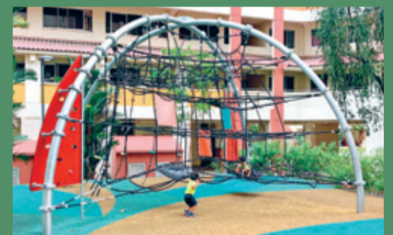
Ongoing NRP at Blocks 711 to 732 Jurong West 71/72, Ave 5, Nanyang Division - Chua Chu Kang GRC

131 blocks have benefitted from the Neighbourhood Renewal Programme (NRP)