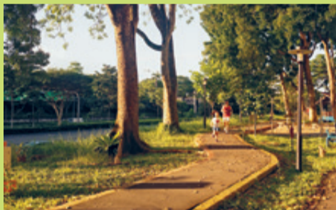
Choa Chu Kang Ave 4