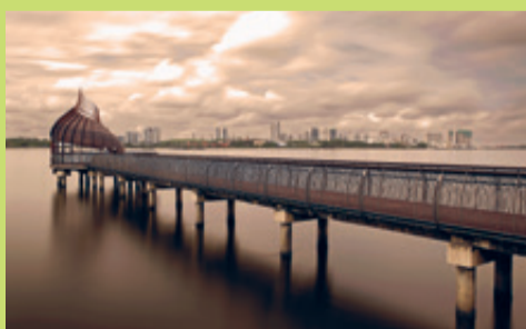
Sungei Buloh Eagle Point