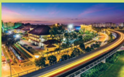
HomeTeamNS Bukit Batok