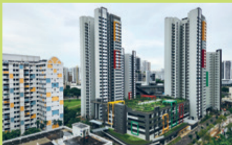
Teck Whye Estate