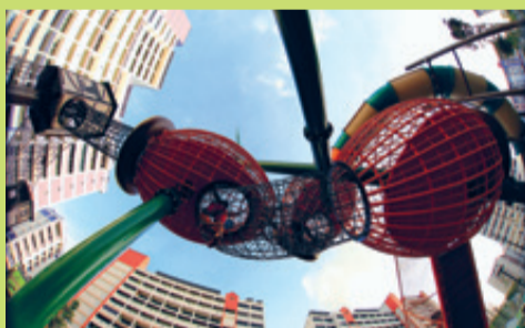
The Arena @ Keat Hong