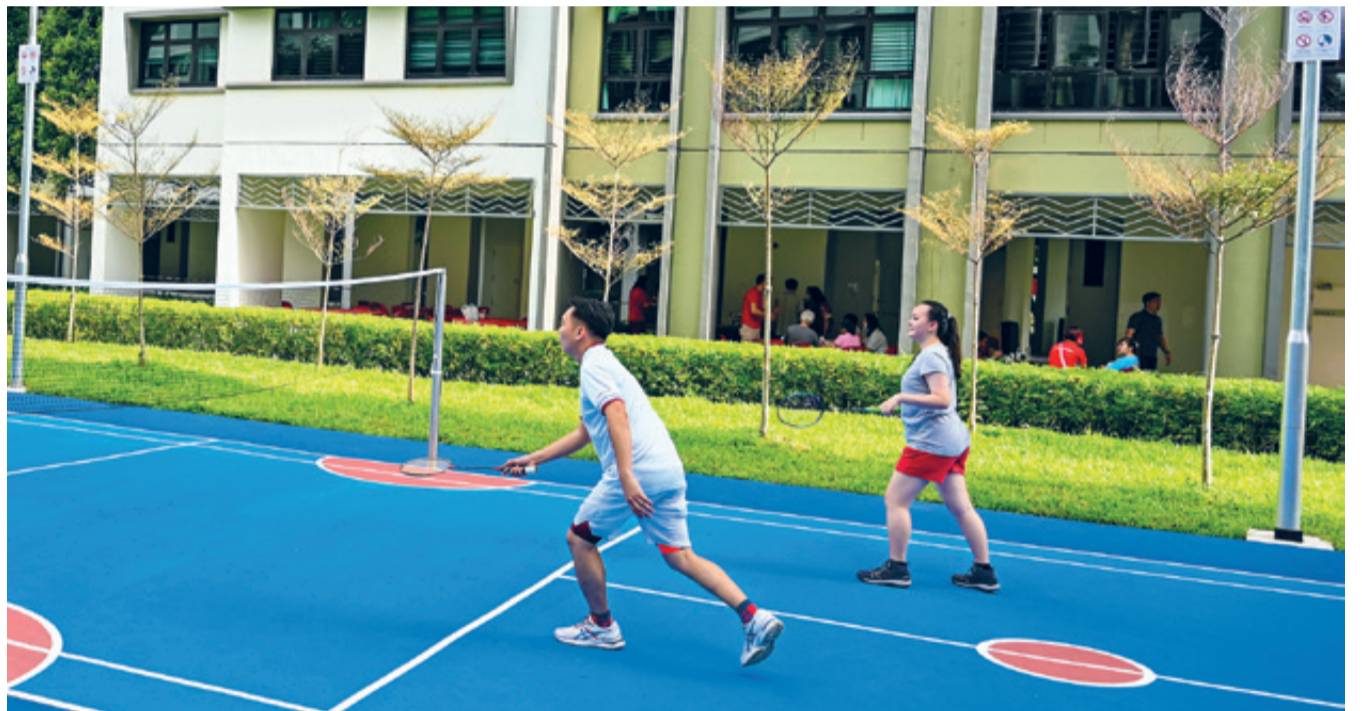
New Multi-Purpose Court at Block 808D Choa Chu Kang Avenue 1