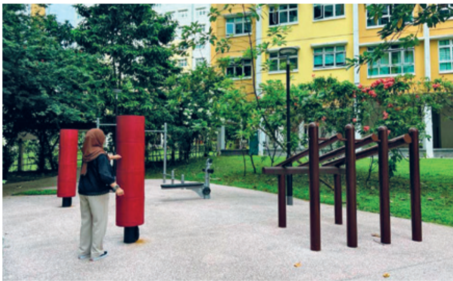
Revamped Fitness Corner at Block 489D Choa Chu Kang Avenue 5