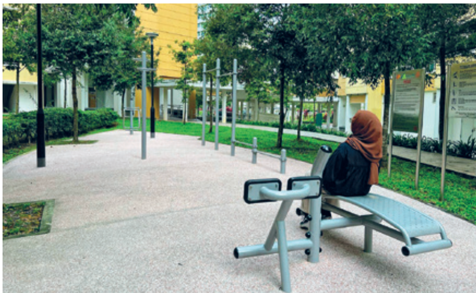
Revamped Fitness Corner at Block 490C Choa Chu Kang Avenue 5