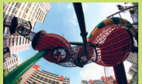
The Arena @ Keat Hong