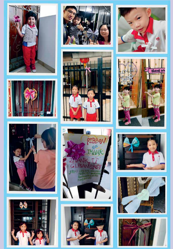
CCK Town's PCF Sparkletot preschoolers showed their gratitude and appreciation for the cleaners with their colourful and personal Ribbons of Thanks display.