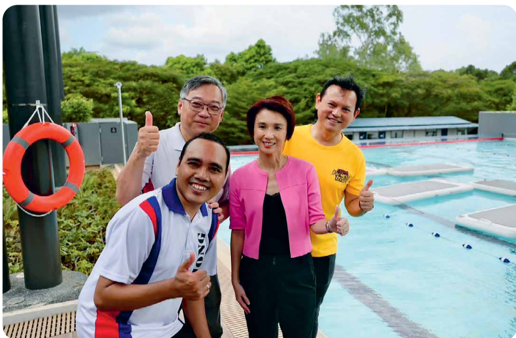
MPS Mr Gan Kim Yong, Mr Zhulkarnain Abdul Rahim, Ms Low Yen Ling and President of SAFRA Mr Zaqy Mohamad at the clubhouse open house.

SAFRA Choa Chu Kang features various facilities and amenities, including a sheltered swimming pool and futsal court, the largest EnergyOne Gym, Bouncetopia, student care and enrichment centres, Sonic Bowl, various F&B options such as Burger King drive-through and more. Get details at www.safra.sg/cck .